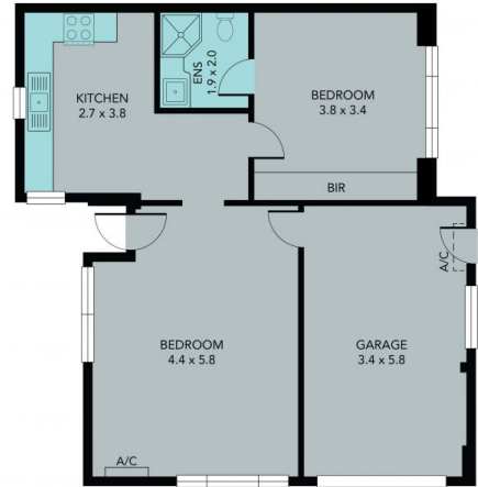
STUDIO (NOT IN POSITION)